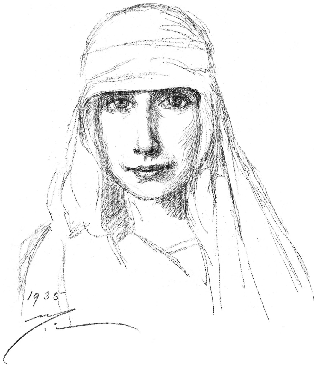
The Mother (Self-portrait)